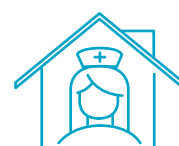
post-surgery home nursing