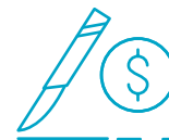
inpatient and outpatient surgical expenses